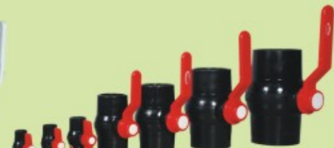
Super Ball Valves